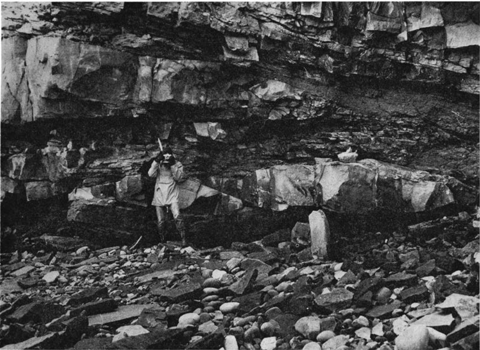
Fig. 3. Cross-stratified sandstones with large scours filled by sandstone and shale. Flow directions to the north. Kapp Levin Member at Kapp Levin.

The member consists of grey and purple sandstones and shales in units up to 25 m thick. Conglomerates are scarce and a few thin coal seams (the Misery series of HORN and ORVIN 1928) occur. Shales contain abundant plant fossils,