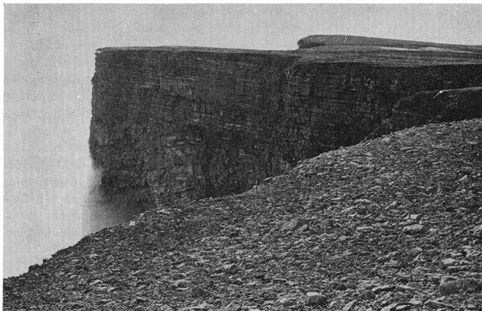
Fig. 7. Gently dipping limestones of the Hambergfjellet Formation rest unconformably upon faulted sandstones and shales of the Roedvika Formation. About 30 m of the Hambergfjellet Formation are exposed. Western cliffs of Alfredfjellet.