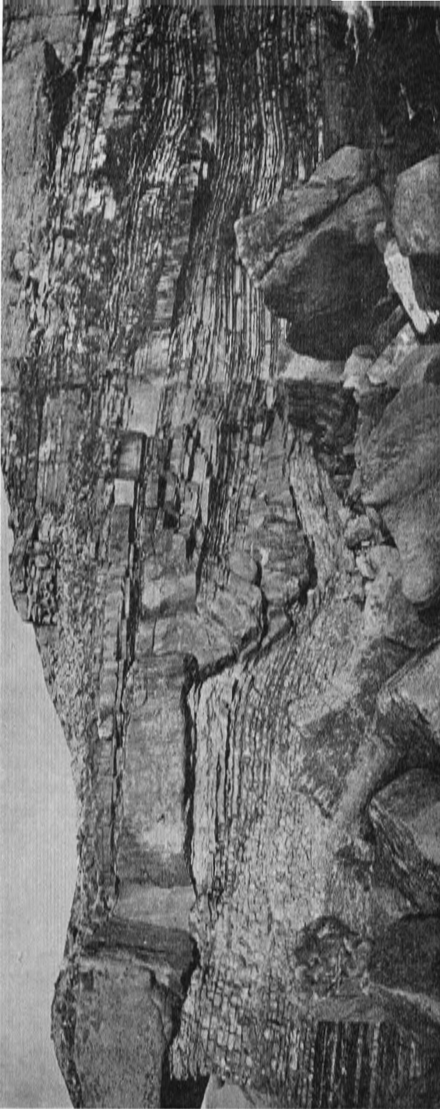
Fig. 6. Facies variation and sedimentary structures in the upper part of the Efgubvika Member at Kobbebukta. About 20 m of section are exposed. Channels cutting into bioclasts and shales are filled with conglomerates which pass laterally into sandy limestones and shales (to the south).