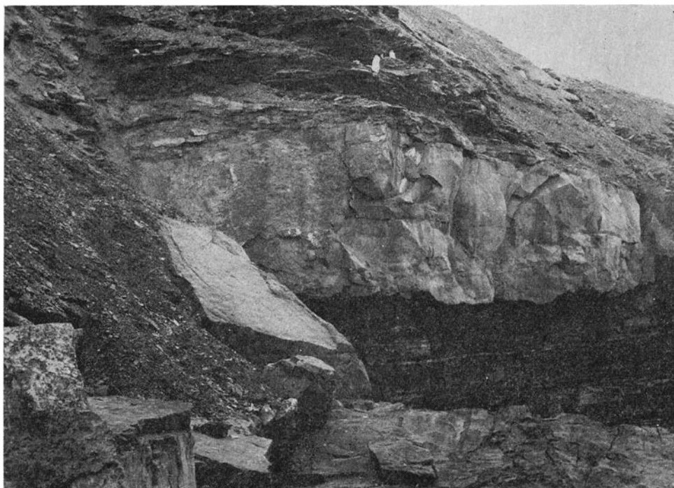
Fig. 4. Fining-upwards sequence in the Tunheim Member north of Tunheim. The base of the sequence is marked by the erosive contact between a 6 m thick massive sandstone and the underlying shale containing the "A" coal of HORN and ORVIN (1928).