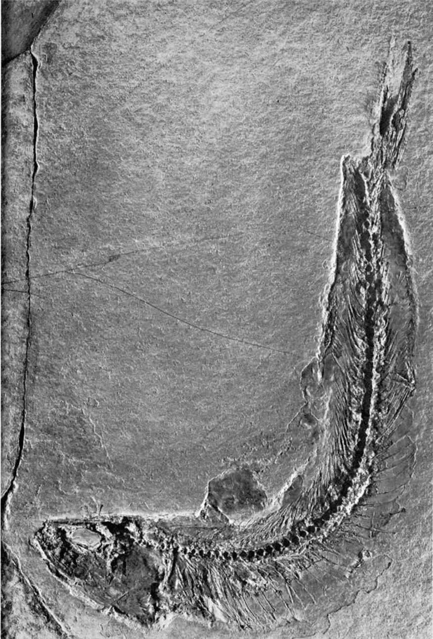
Fig. 2. Thwissops formosus Ag. ( \times 3/4 ). Wintershof near Eichstätt. Malm \zeta 2b. A dead specimen, strongly bent backwardly, rested with the abdominal region on the sea bottom, whereas buoyancy held the front region and head of the fish in an upright, vertical position. When the fish turned over in a horizontal position, the caudal fin, being more or less anchored in the sediment, was torn loose from the rest of the body. Note the different level of the two tips of the caudal fin. View at the underside of the overlying limestone layer.