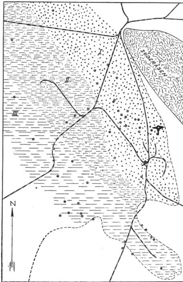
FIG. 2.— Rhaetic sediments, south-west of Söderåsen.

Profiles at right angles to the horst show a gradual diminution in grain-size of the country rock south-westwards. Close to the horst the sediments are dominated by coarse sandstones with angular grains of quartz and weathered feldspar, 1-5 mm. in size, set in a loose cement rich in kaolin. These light arkose-like sandstones are especially well developed between and above the coal beds. The Vallåkra is darker, being green or dark grey, with big angular grains of quartz and feldspar occurring in the clay. Thin clay-beds may already occur in this belt. South-westwards, the sandstones get finer and thinner, and the clays grow thicker (Fig. 2). At the same time the coal beds change. First they divide into one clay bed and one coal-seam, separated by 4 or 5 m. of sandstone. The clay bed then changes into coal, the heavy sandstone into thin clay, and this in turn changes to a bed of fireclay within the coal bed. The transformation (Fig. 3) takes place in both coal beds within a semicircular region below the horst. To the north and south, the coal beds come much closer together. On the south, the landward part has been removed by erosion, but to the south-west we have still the coalfield of Skromberga. There, the main coal beds (A and B) are separated by black clay 4 or 5 m. thick. Northwards, the coal beds reach the immediate vicinity of the horst, and are separated from each other by less than one metre of country rock, sandstone and clay.